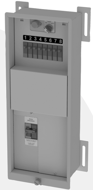
Isometric View (Lid Removed)