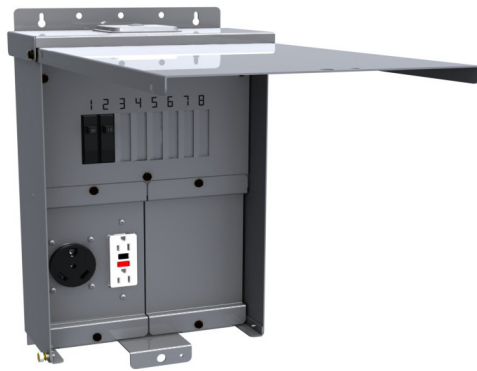
May not be exactly as shown

The CPH15105 RV pedestal head comes complete with receptacles and breakers, with a padlockable self-closing cover. The 16GA galvanized steel body construction offers additional corrosion resistance. Standard PC101 grey powder coat paint provides a durable finish. The Type 3R weatherproof design can be used in both indoor and outdoor applications.