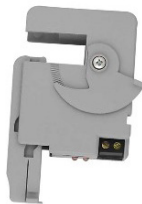
INCLUDES 2 WIRED CURRENT TRANSDUCERS