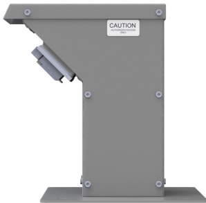
Single side pedestal shown