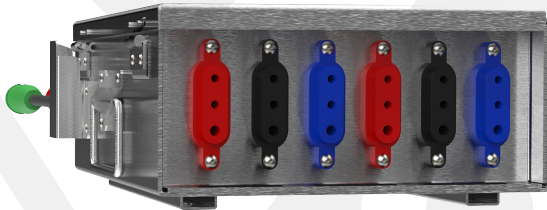
MDE 6 x 60