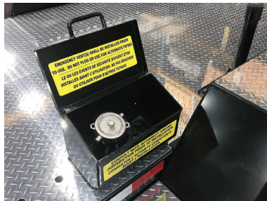
▲ Fill pipe containment box