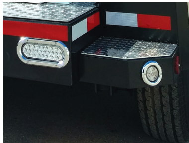
▲ LED lights