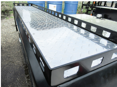
▲ Optional storage tray