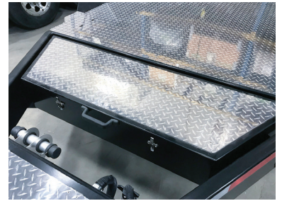
▲ Watertight toolbox