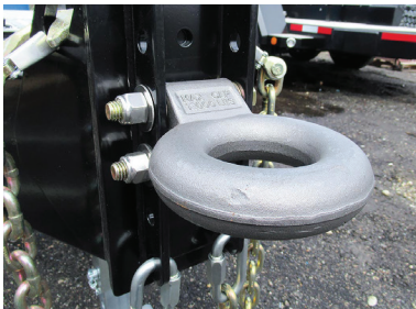
▲ Adjustable pintle hitch