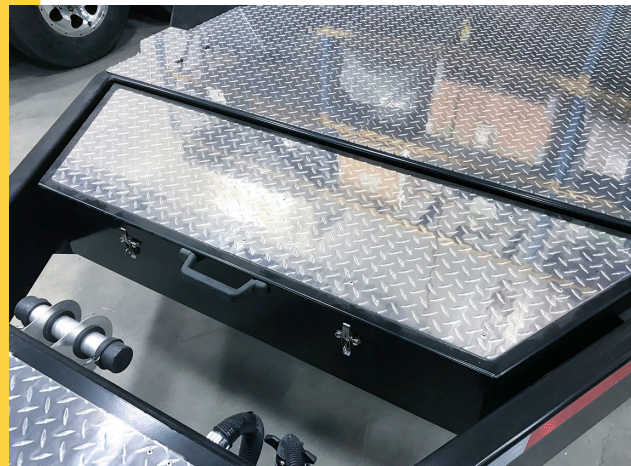
▲ Watertight toolbox

An independent battery in the front compartment powers the trailer brakes in the event of a breakaway. Optional marine-grade checkerplate is found on all walking surfaces, with an optional storage tray on one fender and a watertight lockable toolbox in the front.