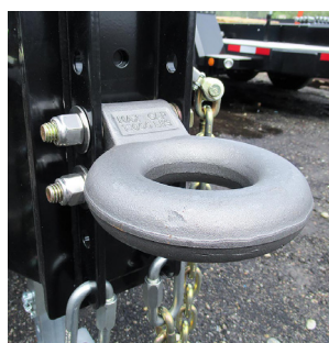
▲ Adjustable pintle hitch