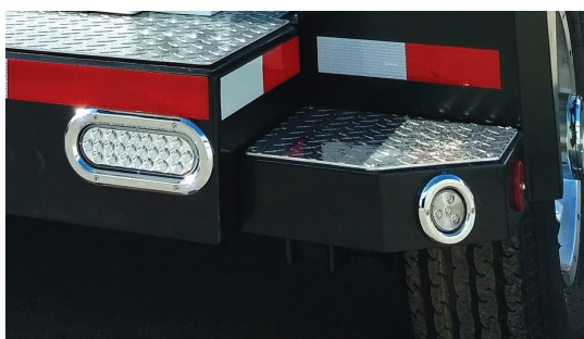
▲ LED lights