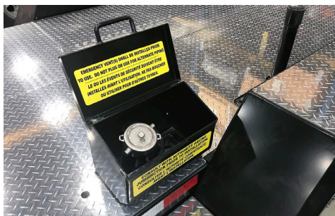
▼ Fill pipe containment box